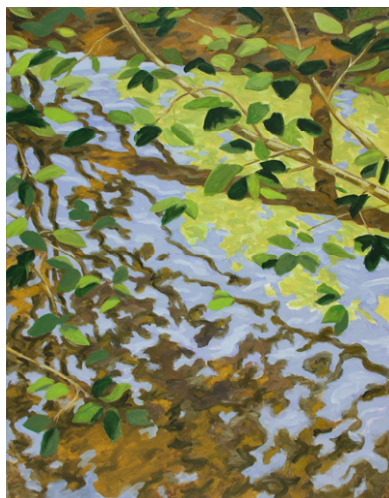
Skowhegan Bridge , 2001, 54 x 42", oil on linen

Opening reception Thursday, September 28, 6 – 8 pm