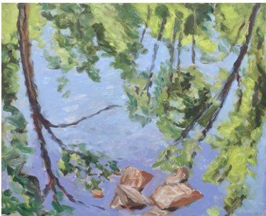
Convergence , 1995, 16 x 20", oil on board

painting might suggest new interpretations as the subject broadened to include not only his memory of the scene but also the record of its observation in the painting itself.