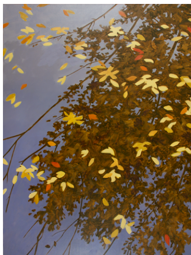
October Water , 1999, 80 x 60", oil on linen

Robert Berlind's second solo exhibition at Lennon, Weinberg is focused on a selection of paintings of trees, water and reflections. The water's rippling surface provided him an opportunity to merge in these works both what lies below and the landscape above. Always an intuitive painter, he was drawn to subjects that were dynamic and unfixed, that challenged the acts of observation and painterly description.