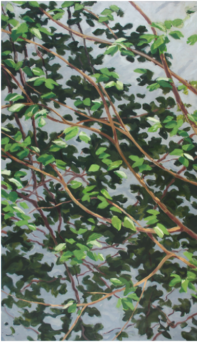
Skowhegan #4 , 2002, 72 x 42", oil on linen