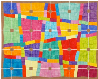
Cythera , 2008 36-1/2 x 45-1/2", collage, acrylic, flashe on linen