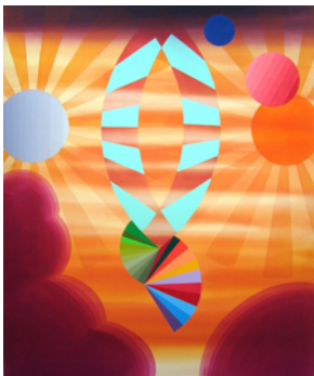
Juno, 2010, 60 x 50"

Stephen Mueller makes very distinctive abstract paintings, immediately recognizable for their color combinations and symbolic shapes. He establishes a radiant atmospheric field and populates it with ovals, banded circles and other rounded forms, and has introduced into these new paintings spectral rays and fans of colored wedges. These elements, along with contrasts between opacity and transparency and framing devices that resemble clouds or theatrical curtains, give the paintings an ambiguous spatial reading while at the same time insisting upon their flatness.