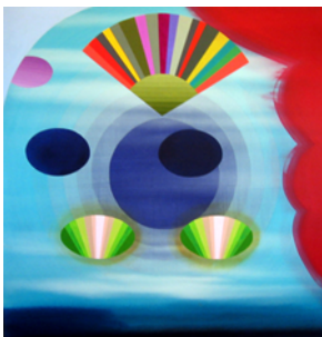
Shu, 2010, 50 x 48"