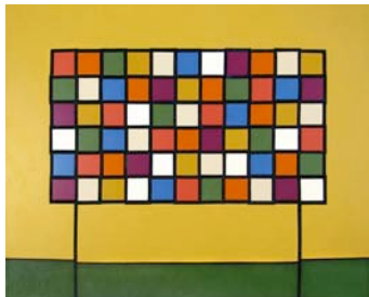
Looking West , 2006 24 x 30", oil on canvas