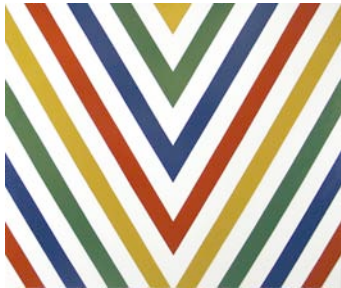
Candyman , 2008 30 x 36", oil on canvas

Opening reception Thursday, October 30, 6-8 pm