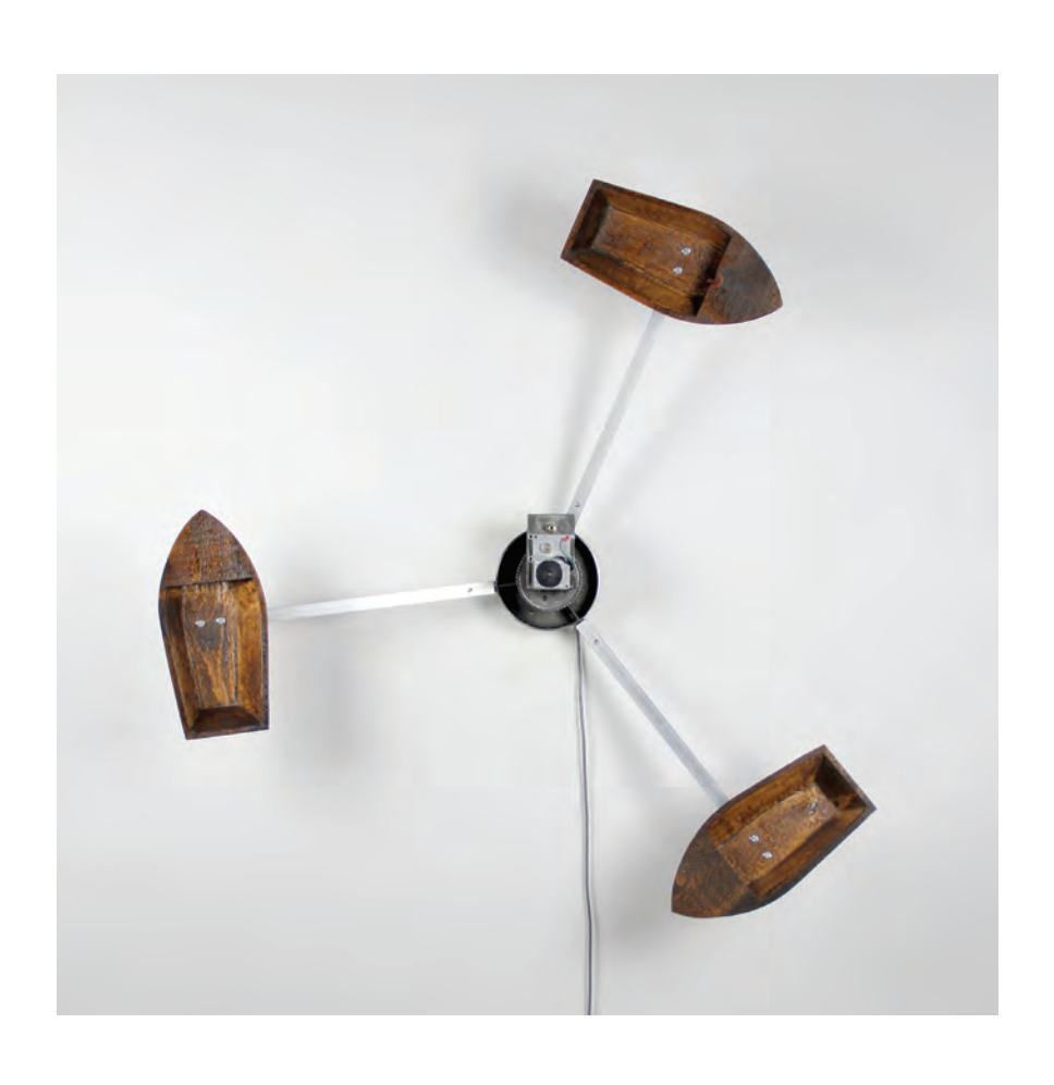
"We may be through with the past, but the past is not through with us." PAUL THOMAS ANDERSON

Untitled (Clock), 2012, 56 inches diameter, 12 inches deep, wood, steel, aluminum, and motor