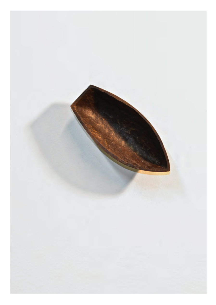
Adrift, 2013, 4\frac{3}{4} x 2 x 1 inches, cast bronze