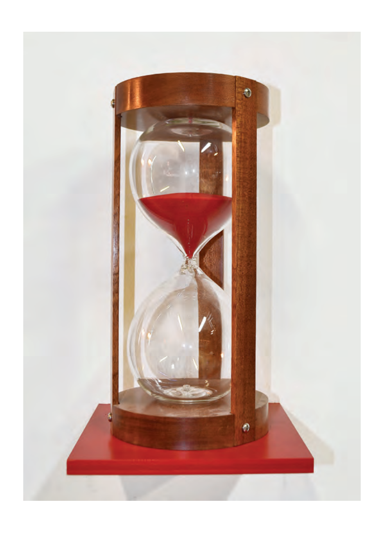
"Lost time is never found again." BENJAMIN FRANKLIN