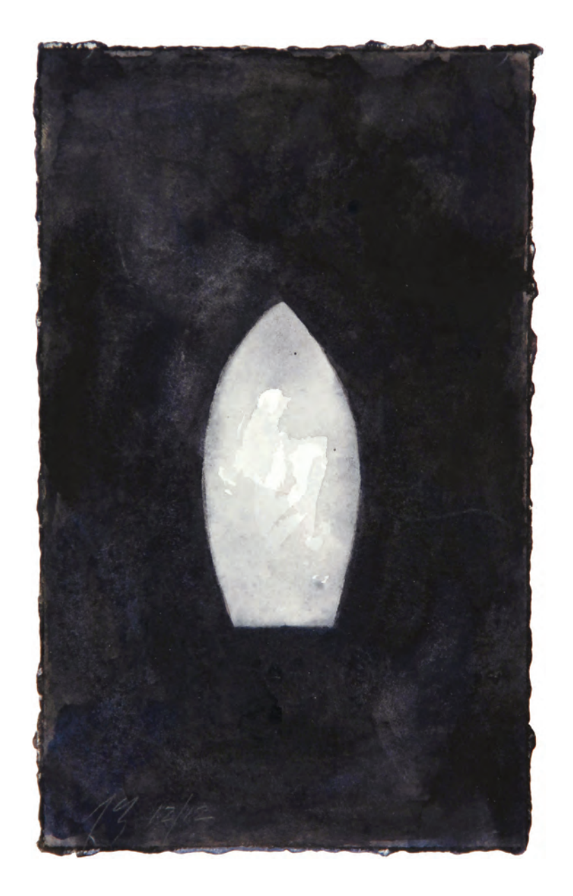
Study for "Adrift", 2012, 7\frac{1}{4} x 4\frac{1}{2} inches, watercolor on paper