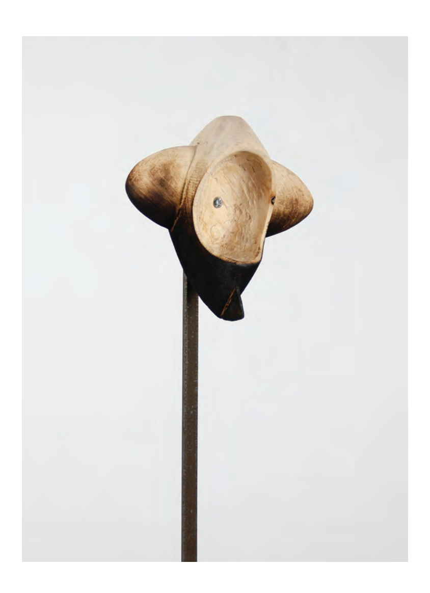
Untitled, 2013, 6 \times 7 \times 3 inches, steel and wood