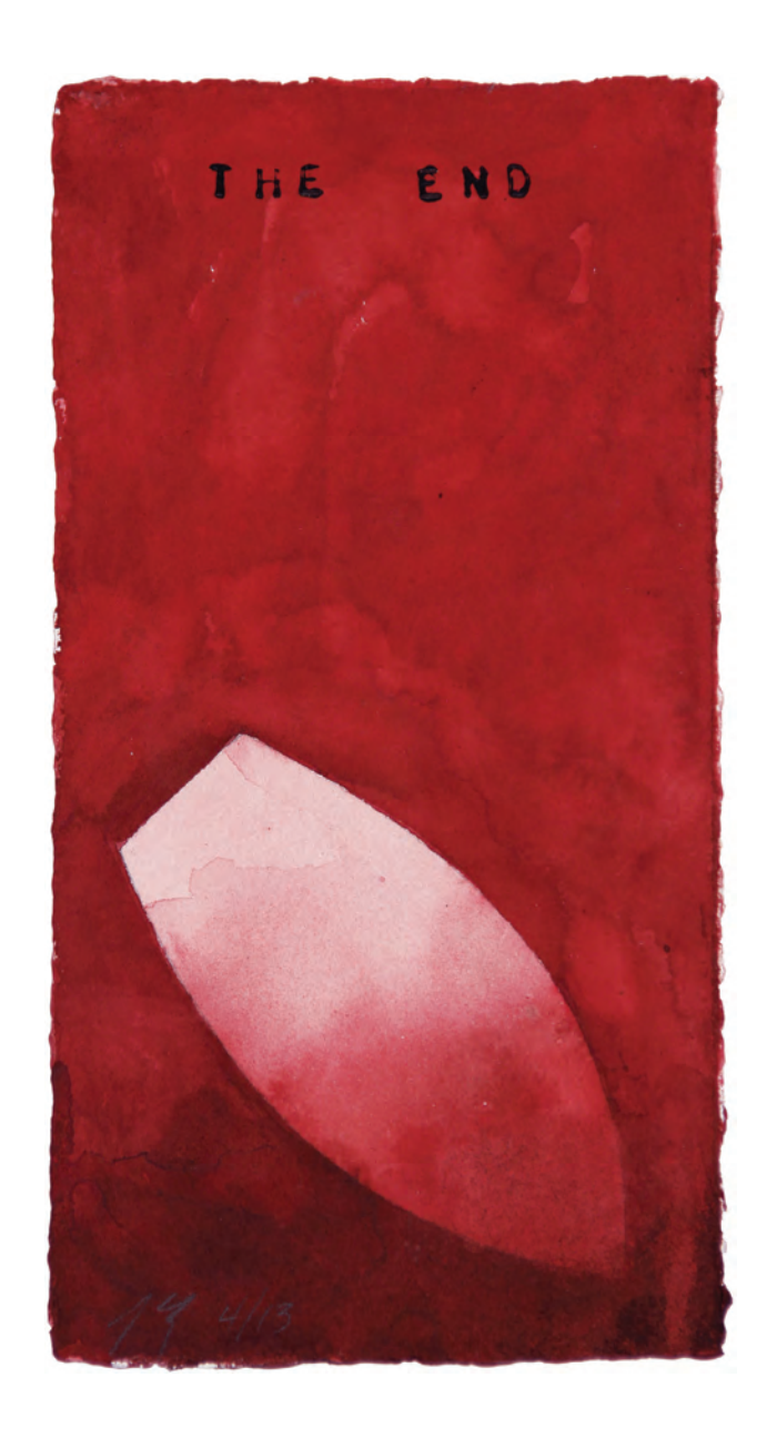
The End, 2013, 9 x 4\frac{3}{4} inches, watercolor on paper