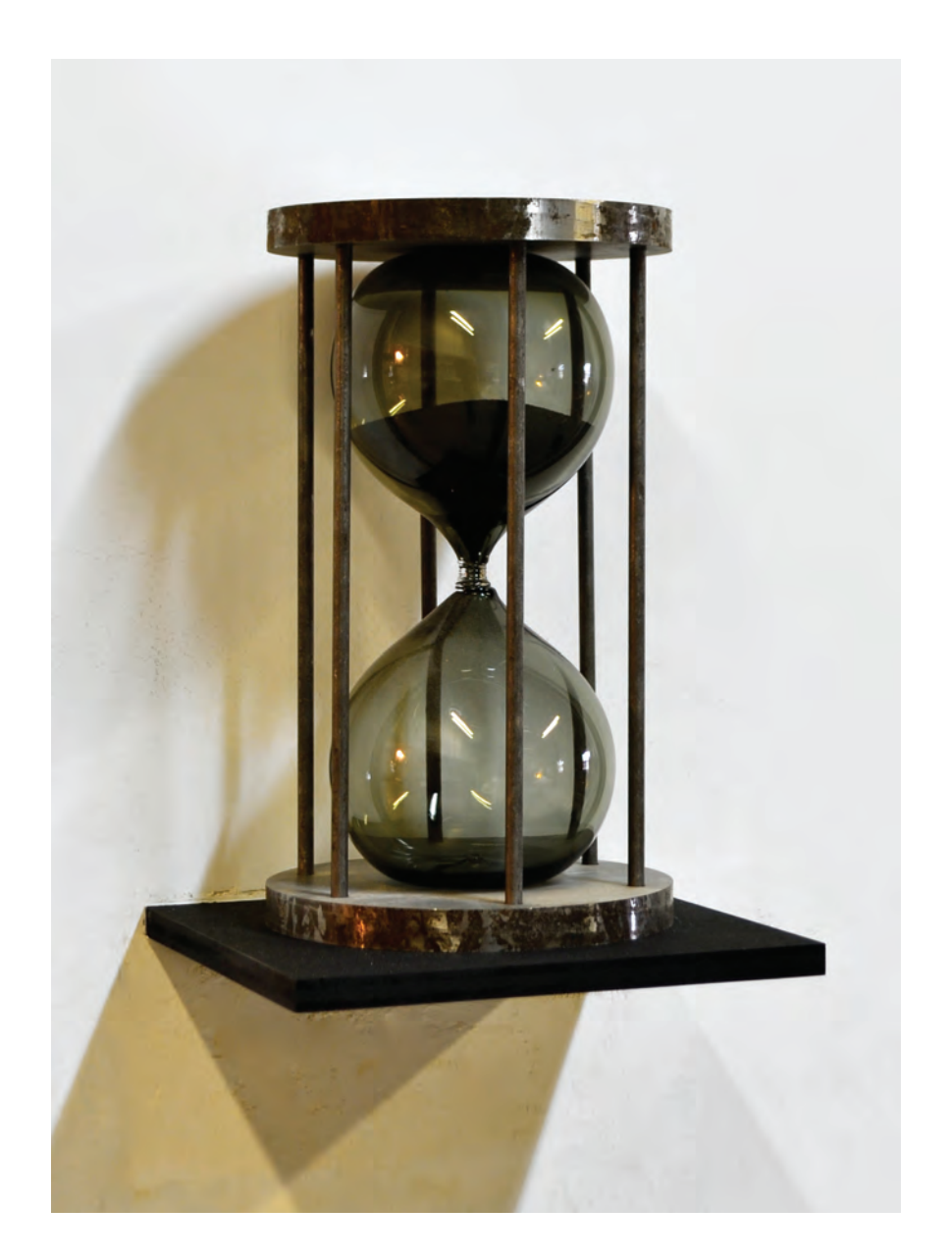
Stand Still Goddamnit 2, 2012, 11 x 8 x 8 inches, steel, glass, sand