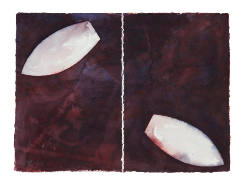
"There was a beautiful time..." SYLVIA PLATH