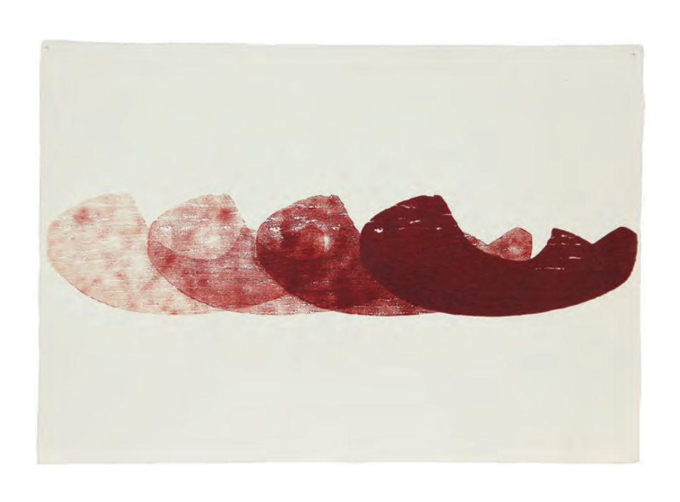
"The past is never dead. It's not even past." WILLIAM FAULKNER