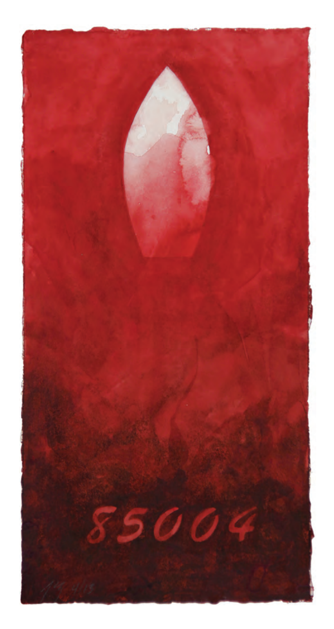
85004, 2013, 14 \frac{1}{4} x 7\frac{1}{4} inches, watercolor on paper